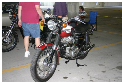
Brad's Triumph Motorcycle