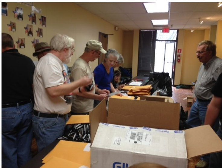
Stuffing Party, preparing registration bags a few days before the SC VTR Conference.