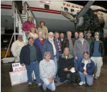
The hardest members