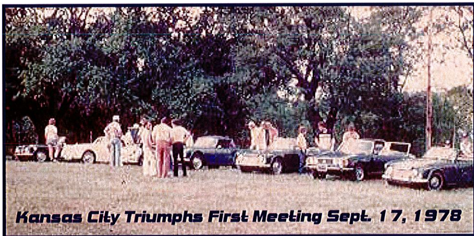
Kansas City Triumphs First Meeting Sept. 17, 1978