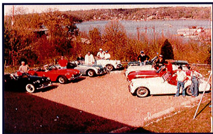
1 st Annual Ozarks Trip April 1979